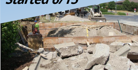
Storage Garage Construction 6/18/21