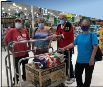
Trivent Action Team