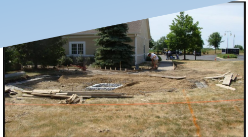
Memory Garden Construction 6/18/21

Contact: Ralph Wehnes ralphwehnes@sbcglobal.net